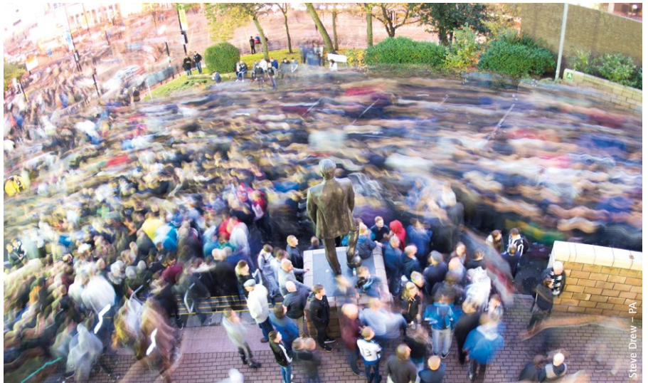
Crowds of football supporters leaving St James' Park stadium in Newcastle

Large scale evacuation is a complex phenomenon, especially due to the role of evacuees and their actions and decisions. The complexity embedded in this process has begun to be addressed only recently, with the use of computer evacuation models along with enhanced data collection on human performance and movement.