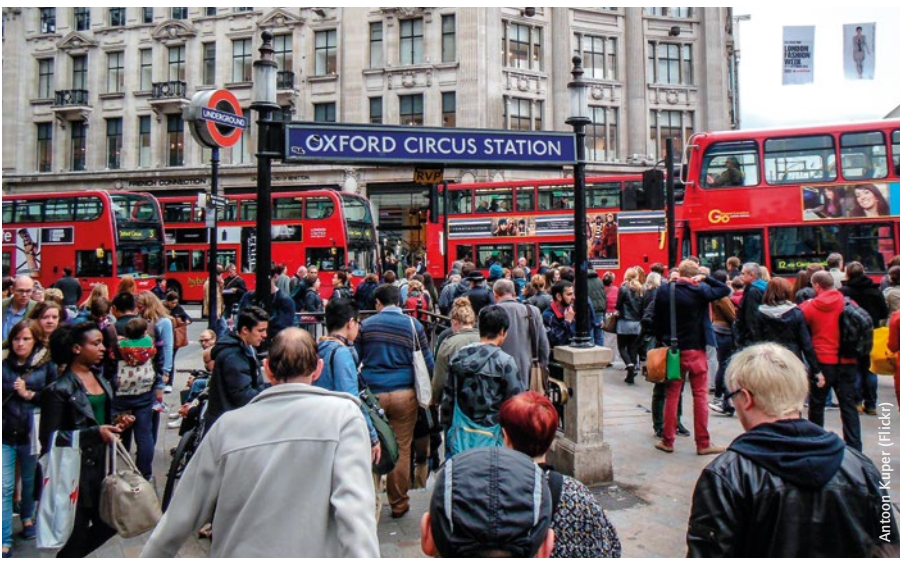
By 2050 over 70% of the world's population is predicted to live in cities, putting increased strain on urban infrastructure and transport systems

One of the benefits of big data for transport planners is the ability to track movements of vehicles and people on a scale never before imagined. The potential to use information generated